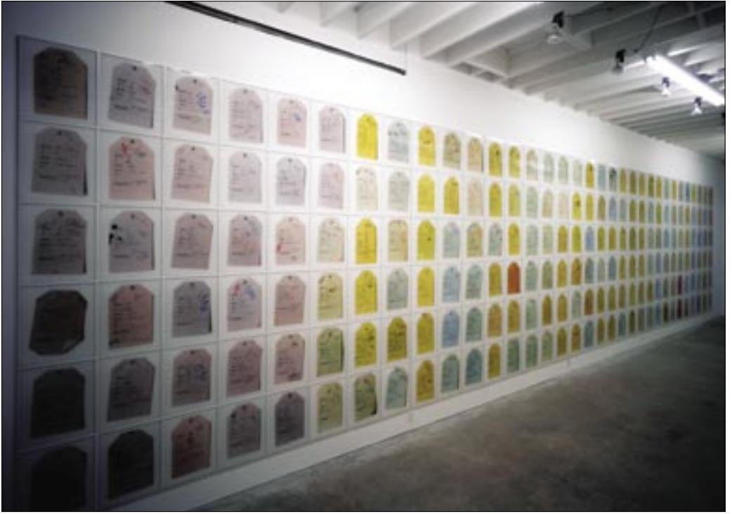
Fig 4 Arnaud Maggs, Travail des enfants dans l'industrie 'les étiquettes' , 1994, edition of 3, 198 framed color photographs, 51 × 40 cm each.

series as a memorial to the young workers, as each label records the name and labor of a girl who was employed in the weaving industry in France before child labor was outlawed (Monk 1999). This work is engaging because of the repetitive beauty of the colored labels, and it is moving because of the sheer number of labels arranged in a floor to ceiling grid along a wall. The absence of each body is marked by a label, which stands as evidence of that body's labor. It is precisely the absence of bodies that allows viewers to feel the impact of labor practices on these lives. Here, seeing is feeling.