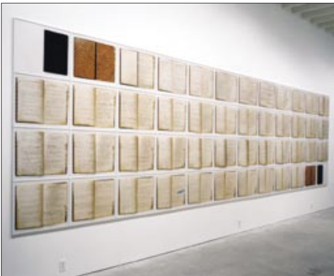
Fig 7 Arnaud Maggs, Répertoire , 1997, edition of 3, 48 framed color photographs, 205 × 735 cm.

evocative element that strikes viewers with affect (Figure 7). This composition of color photographs displays in extravagant detail the pages of turn-of-the-century Parisian photographer Eugène Atget's address book. As is well known, Atget understood his photographic practice as the documentation of Paris. He sold his photographs to painters, interior designers, and stage designers, who used the images as source material, as well as to French museums and libraries, where his photographs were valued as historical documents. There is a lovely layering of archival references in this piece. Just as Atget's address book records a detailed account of his own photographic practice, through which he compiled a kind of archive of the medieval city of Paris, Maggs has archived the records of that practice through his own intervention in the archives of the Museum of Modern Art, New York, where the address book resides. As Bédard