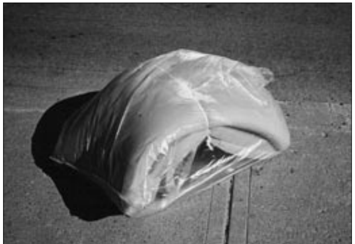
Fig 3 Greg Staats, Animose , 2002, detail, silver print, 16 × 20 inches.

tightly tied string and curls from the snugly wrapped plastic. The warped form appears to be sitting on a cracked concrete sidewalk at the side of a road. It is illuminated with a bright, directional light that reflects off the plastic wrap, causing a curving shadow to extend to the left of the bulging form. The formal qualities of the image transform the discarded object into something that