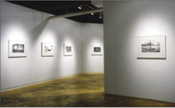
Fig 2 Greg Staats, Animose , 2002, 25 silver prints, 16 × 20 inches each. Courtesy of Greg Staats.

narrative structure. Another consistency in this series is the importance of the fine formal qualities of the photographs for the way viewers engage with the work. In each image, an object is centered within the frame. One photograph in the series shows a soft object, perhaps a foam pad, which has been tied with string and wrapped in a plastic bag (Figure 3). The soft form bulges under the