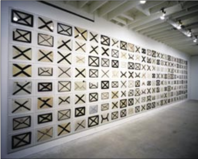
Fig 5 Arnaud Maggs, Notification i , 1996, edition of 3, 96 framed color photographs, 40 × 51 cm each, installed 306 × 660 cm.